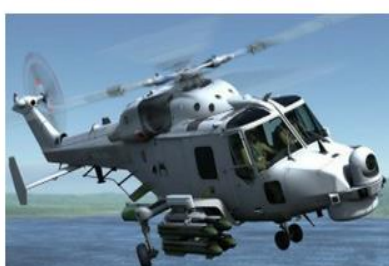
Royal Navy SeaLynx