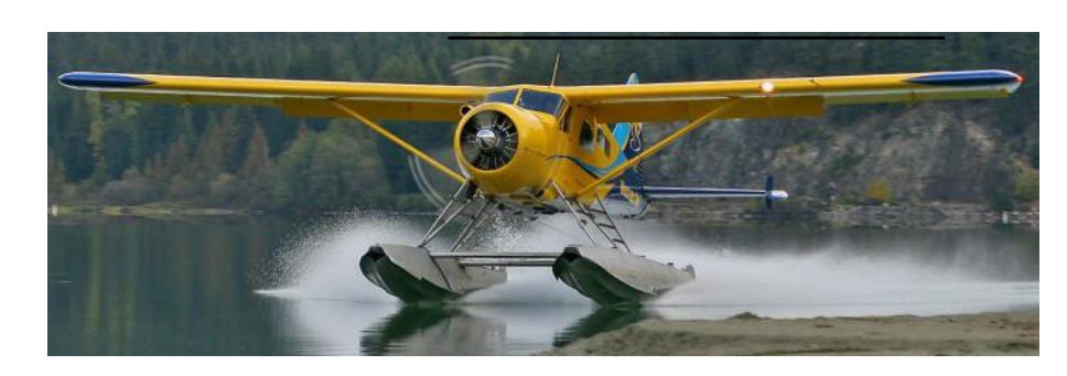
TCCA #SA13-62, FAA #ST02413AK: